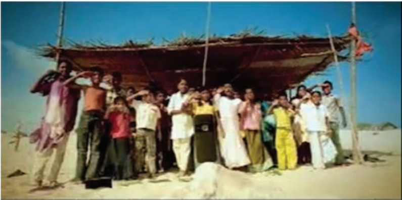
Figure 12: Snapshot from Idea Education for All ad.