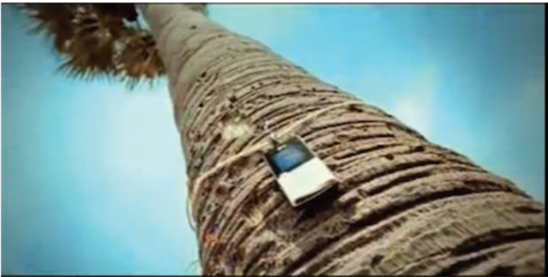
Figure 11: Snapshot from Idea Education for All ad.