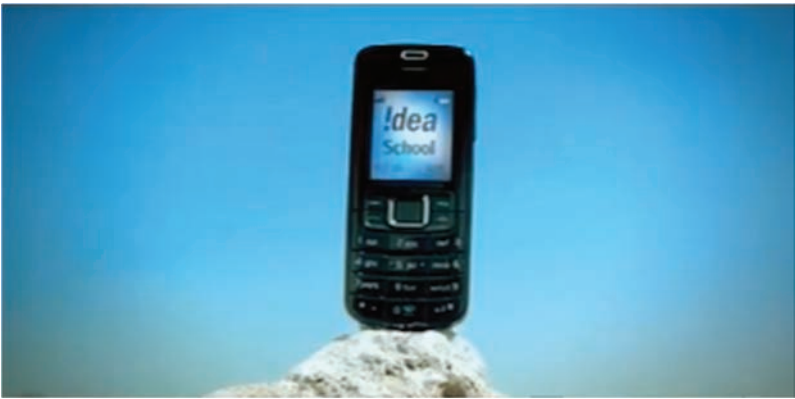
Figure 10: Close-ups and zoom-ins of mobile phone (snapshot from Idea Education for All ad).