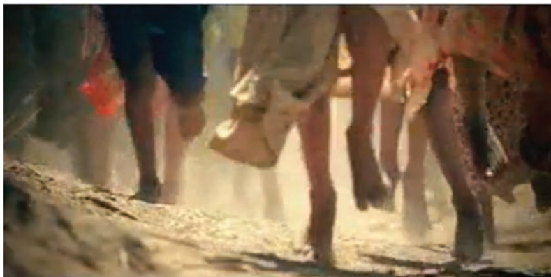
Figure 2: Rhythm of running feet in sync with Idea caller tune played as soundtrack (snapshot from Idea Education for All ad).

The sparking of the 'idea' of education through mobile telephony is conveyed through a shift from the pensive face of the principal to rapidly edited scenes showing groups of enthusiastic children in villages running across landscapes with green fields, desert, pine trees, and mud and brick buildings in the background. The soundtrack shifts from quiet notes to the signature Idea caller tune, which conveys the impression of being played in the same rhythm as the children's running feet. This call to education, bright and early in the morning, is made synonymous with Idea Cellular's caller id and the ability of mobile technology to self-activate neo-liberal subjects is given expression in the form of the smiling faces of children, their running feet and their eager, responsive cries (see Figure 2).