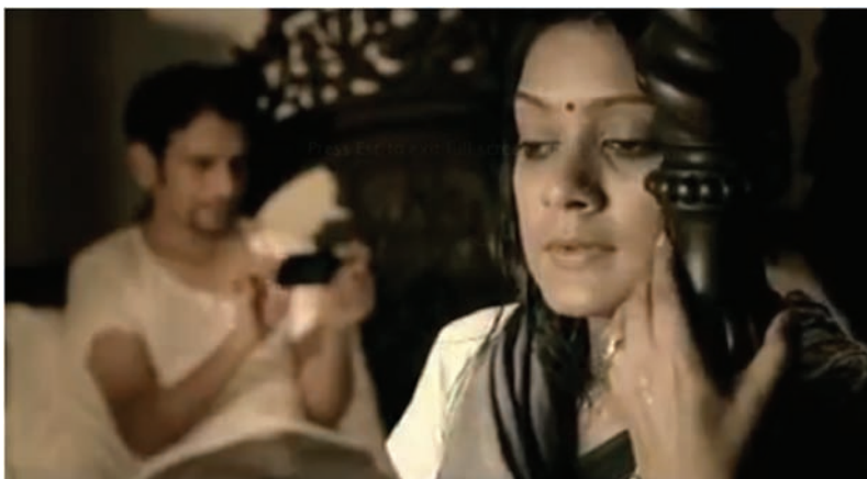
Figure 5: Woman resolves to sacrifice as husband is busy with Idea 3G (snapshot from Idea Population ad).

pleasures of 3G mobile in the background (see Figure 5). The Idea Population ad clearly suggests that such a woman becomes a worthy citizen precisely because of her consumerist choice. When the women with such a resolution opens the doors of her house she finds a huge public gathered around the shared balcony space who are repeatedly addressing her as 'Tu Devi'/'You are Goddess' and glorifying her sacrifice (see Figures 6 and 7).