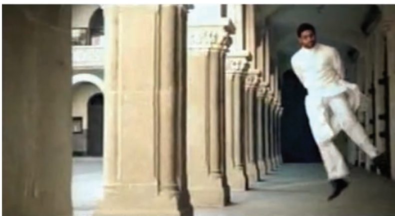
Figure 3: Snapshot from Idea Education for All ad.

state is supposed to provide these social rights but the ad suggests that the state's responsibility can be shifted to corporate social responsibility (CSR) and individual responsibility. Idea Education for All ad brings into focus the rural–urban divide within the Indian society in terms of access to education, a social right required to produce capable citizens of a nation, but proposes that this divide could be bridged by bridging the telecommunication divide between rural and urban India. Therefore, the need is for more Idea Cellular phones and networks in the Indian villages.