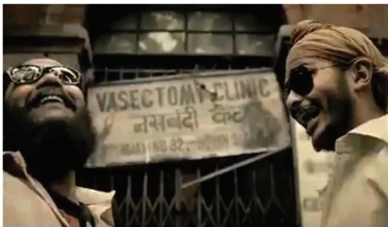
Figure 4: No need of vasectomy clinics because Idea 3G data services are available (snapshot from Idea Population ad).

Explicating the advertising discourse and the consumer attitude in life, Cronin notes how 'actualizing one's potential as individual and citizen of a national community becomes intertwined: as consumerist choice , which comes to be seen as a right and a duty to express one's inner, authentic essence ' (2000: 32, emphasis added). A married Indian woman equates the self-regulated use of the Idea 3G network and the concomitant non-indulgence in sexual activities to a 'sacrifice' that she is ready to make for her nation – she contemplates this in the foreground as her husband is shown to be immersed in the