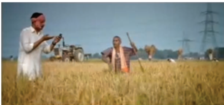
Figure 8: Snapshot from Idea Democracy ad.

with, as an Idea Cellular executive noted, was about answering a constant brief from their client Idea Cellular: ‘An Idea can change your life’. While this brief certainly helps in coming up with ideas of social change based on particular ways of using mobile telephony, it is not just for Idea Cellular that Lowe Lintas created social message ads that take up (or seem inspired by) contemporary popular issues and events. They have executed with great success the Tata Tea Jaago Re ad campaign, designed to awaken the socially conscious citizen in the Indian masses as they are encouraged and convinced to go and exercise their right of voting and to stop paying or taking bribes. Lowe Lintas CEO, R. Balki, in an interview given to the Storyboard show (SenGupta 2011), claimed that his agency was able to see the prevalent widespread discontent with corruption and the political system and they seized upon it before the dissatisfaction reached its explosive stage and ushered in a nationwide Anna movement. 6 The timing of these ad campaigns (both Idea Cellular and Tata Tea campaigns) brings into sharp focus the contingencies within which advertising thrives and notions of popular that it borrows from.