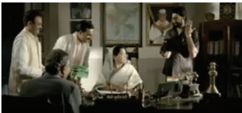
Figure 1: Contrasting sartorial choices and conspicuous presence of an old telephone set (snapshot from Idea Democracy ad).

The semiotic codes and the choices made are indeed revealing. The secretary's conduct embodies a practice of 'technology of governing' (Ong 2006) as he is able to find the cutting-edge technological solution (adopts the more modern cellular phone network to a landline telephone) for a political problem of public participation in decision making. At the same time he also represents the perfect blurring of boundaries between the market and the state. He is associated with a political leader/party (state) and yet is in touch with the latest fashion both in terms of wearing a stylish shirt and carrying an Idea mobile (market). He is not only an 'ideal consumer-citizen' himself but preaches consumer citizenship by facilitating public participation of potential consumers by encouraging them to exercise their option of joining the Idea Cellular network. Here the state government finally embraces consumerism, in as far as it means efficiency of service delivered.