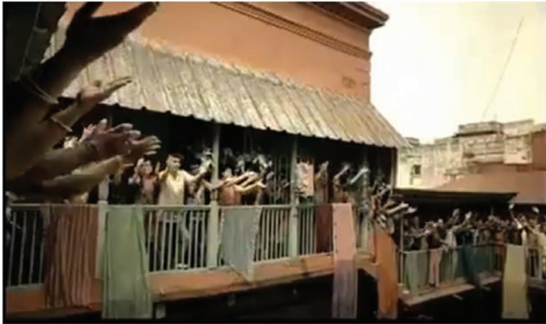
Figure 7: Public acknowledgment and celebration of the woman's sacrifice (snapshot from Idea Population ad).

advertising discourses appreciate the challenge of demonstrating how these technologies-of-the-self (3G mobile phones) can be shown to coalesce a public around a collective issue or problem. Thereby, at an affective level, the Idea Population ad does make an effort to merge the private and the public, the individual and the collective, and the logics of consumerism and development.