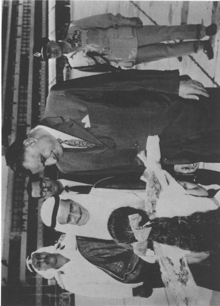
FIG. 4.— Meeting Nasser . Original found image.