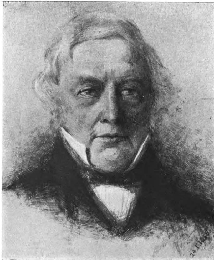
THOMAS LOVE PEACOCK