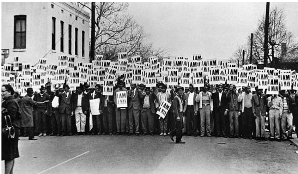
Figure 3. Becoming man. (I Am A Man , Sanitation Workers Strike, Memphis, Tennessee, March 28, 1968)

These are becomings, all: a lesbian becoming Indian, a black man becoming Man, a woman becoming animal. But putting it this way, there are at least two differences between the first two and the last one. The first two begin with a movement from the particular (molecular) to the general (molar), while the last one begins with a movement from the general-particular (human—but still only woman) to the particular. The first two, in other words, are majoritarian, the last one minoritarian. This first difference can probably explain the second, which