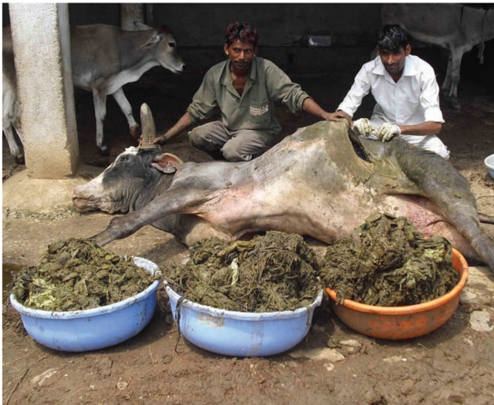
Figure 1. Death by rubbish.

just knowing that they were in the cabinet served a purpose. They would never let me stop.” She then told me about her illicit visits to the Idgah slaughterhouse in New Delhi, whose horrors she filmed and later had shown on the state-owned broadcast service, Doordarshan (an effort by the government, no doubt, to whip up anti-Muslim sentiment under the guise of compassion). The Idgah slaughterhouse has a capacity to process 2,500 animals per day for meat, leather, and by-products, but instead it butchers upward of 13,000 animals daily, around 3,000 buffaloes and 10,000 goats. 15 The animals are brought in from miles around the city, thrown from the trucks into heaps by their limbs, most with their legs already broken and some crushed to death from the journey. Boys and men begin the process of hacking and skinning the animals with rusty knives, the butchers barefoot and shin-deep in blood and shit. There are few sights more heart-breaking—or for those less sentimental than I, more ironic—than of sickly cows eating from the nearly one thousand pounds of cattle excrement, body parts, and clotted blood that the Idgah slaughterhouse dumps at a nearby landfill, a playground for kite-flying slum children, every day.