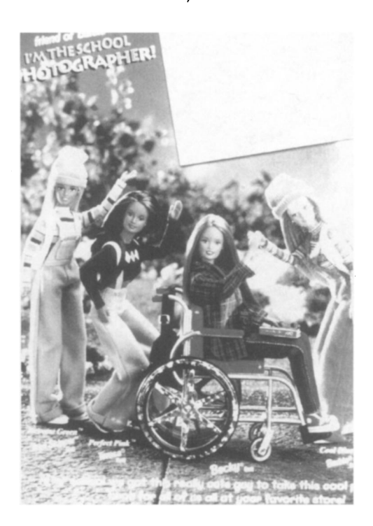
Fig. 5. Barbie's friend Becky, the School Photographer

disabled, Stohl wrote to editor Hugh Hefner that she wanted to pose nude for Playboy because "sexuality is the hardest thing for disabled persons to hold onto" ("Meet Ellen Stohl" 1987, 68). For Stohl, it would seem that the performance of excessive feminine sexuality was necessary to counter the social interpretation that disability cancels out sexuality. This confirmation of normative heterosexuality was then for Stohl no Butlerian parody, but rather the affirmation she needed as a disabled woman to be sexual at all.