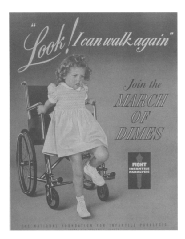
Fig. 4. March of Dimes poster child, 1949.

and functions the dominant order calls disability is, on the other hand, a eugenic undertaking. The ostensibly progressive socio-medical project of eradicating disability all too often is enacted as a program to eliminate people with disabilities through such practices as forced sterilization, so-called physician-assisted suicide and mercy killing, selective abortion, institutionization, and segregation policies.