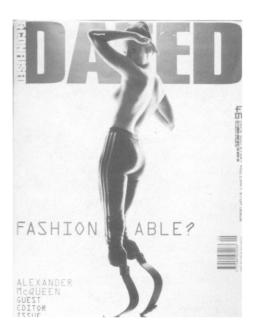
Fig. 7. Aimee Mullins using functional legs.