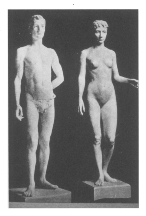
Fig. 2. 1893 anthropometric composite figures by Dudley Sargent of normative man and woman in European culture.

what Susan Bordo terms "cultural plastic" (1993, 246) through surgical and medical interventions increasingly pressures people with disabilities or appearance impairments to become what Michel Foucault calls "docile bodies" (1979, 135). The twin ideologies of normalcy and beauty posit female and disabled bodies, particularly, as not only spectacles to be looked at, but as pliable bodies to be shaped infinitely so as to conform to a set of standards called normal and beautiful .