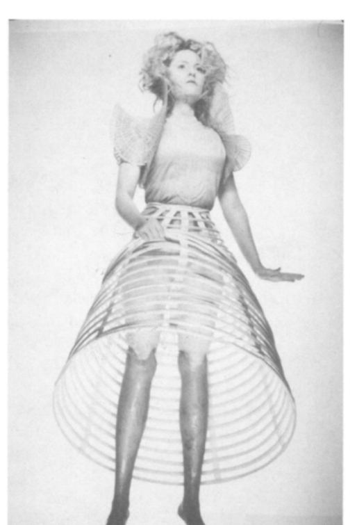
Fig. 8. Aimee Mullins using cosmetic legs.